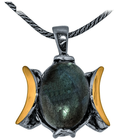
Silver and Gold Pendant $ 38.00