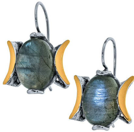
Silver and Gold Earrings $ 68.00