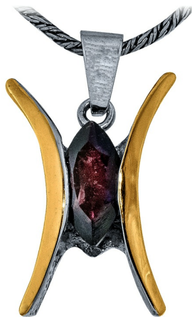
Silver and Gold Pendant $ 18.00