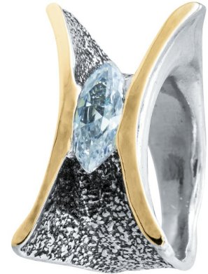
Silver and Gold Ring $ 31.00