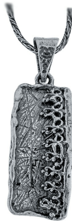
Silver Pendant $ 19.00