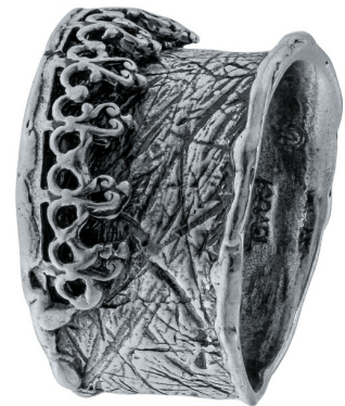
Silver Ring $ 23.00