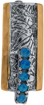
Silver and Gold Earrings $ 46.00