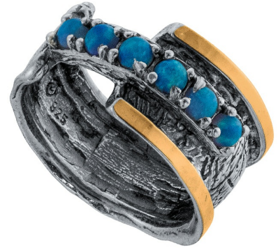
Silver and Gold Ring $ 35.00