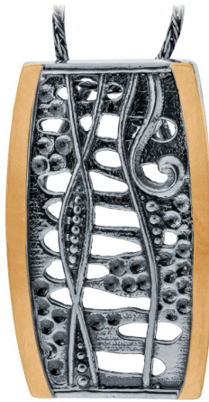
Silver and Gold Pendant $ 40.00