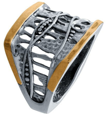
Silver and Gold Ring $ 44.00