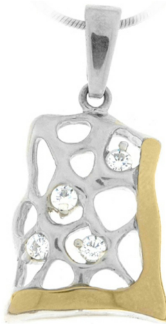
Silver and Gold Pendant $ 22.17