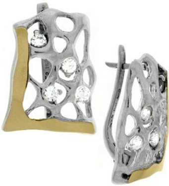
Silver and Gold Earrings $ 43.04