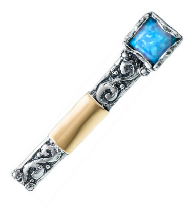
Silver and Gold Brooch $ 25.00