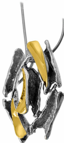
Silver and Gold Pendant $ 36.00