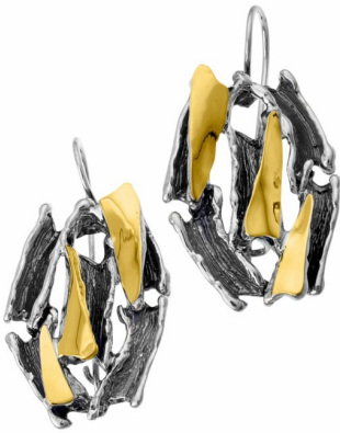
Silver and Gold Earrings $ 57.00