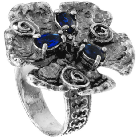
Silver Ring $ 22.17