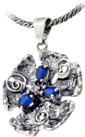
Silver Pendant $ 13.04