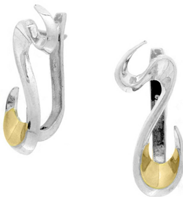
Silver and Gold Earrings $ 26.09