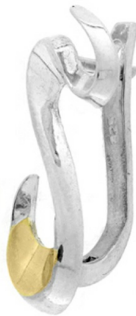
Silver and Gold Earrings $ 26.09