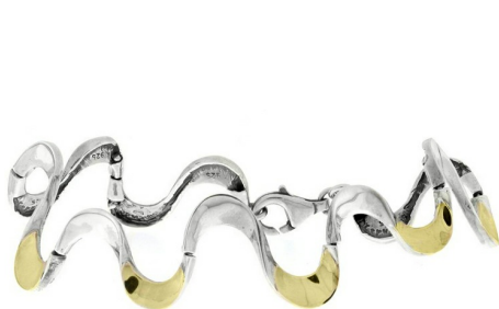
Silver and Gold Bracelet $ 65.22