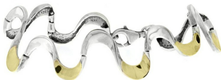
Silver and Gold Bracelet $ 65.22