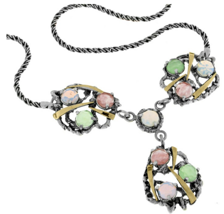
Silver and Gold Necklace $ 94.78