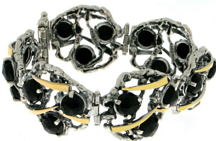
Silver and Gold Bracelet $ 177.83