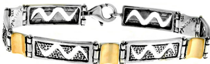
Silver and Gold Bracelet $ 52.17