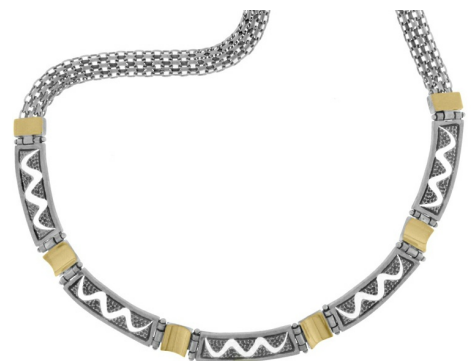
Silver and Gold Necklace $ 70.00