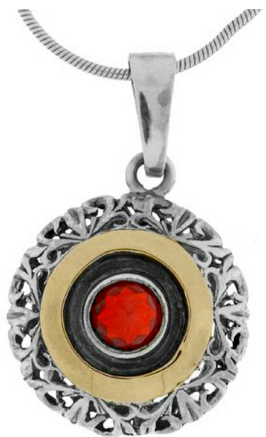
Silver and Gold Pendant $ 20.87