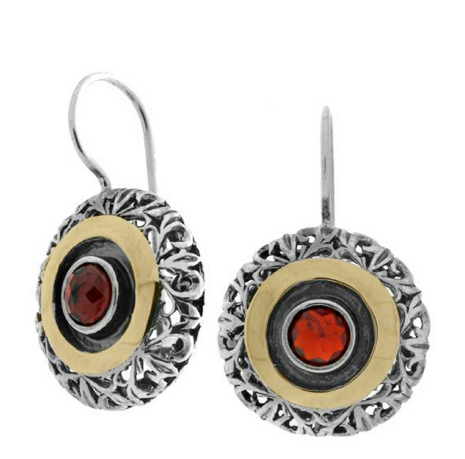
Silver and Gold Earrings $ 40.00

You can comfortably purchase with Simenda Jewellery and receive a True Two tone Silver & Gold Jewellery at a decent price.