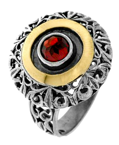
Silver and Gold Ring $ 30.87