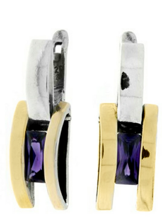
Silver and Gold Earrings $ 34.78