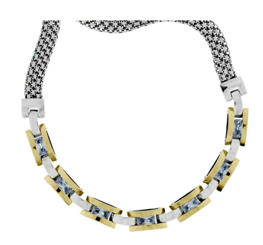
Silver and Gold Necklace $ 140.00