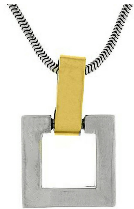
Silver and Gold Pendant $ 19.13