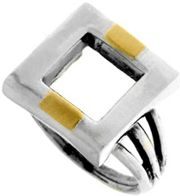
Open window $ 26.96