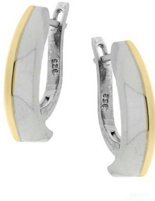
Silver and Gold Earrings $ 29.13