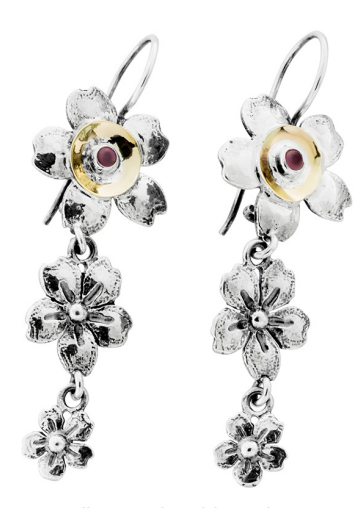
Silver and Gold Earrings $ 37.83

If the gemstone you wish isn't in the list please contact us to see if the gemstone in stock.