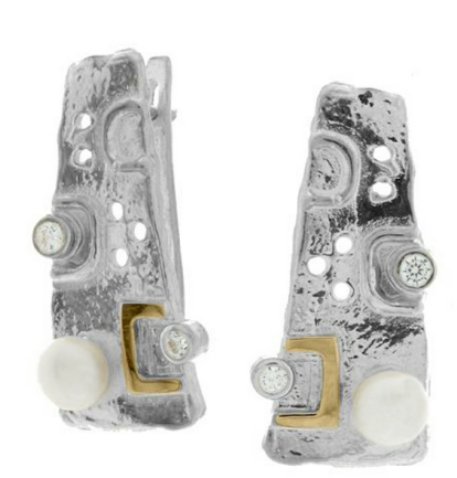
Silver and Gold Earrings $ 39.13

You can comfortably purchase with Simenda Jewellery and receive a True Two tone Silver & Gold Jewellery at a decent price.