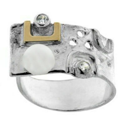
Silver and Gold Ring $ 20.87