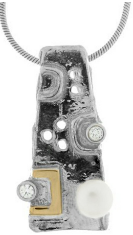
Silver and Gold Pendant $ 16.09