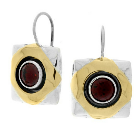
Silver and Gold Earrings $ 65.22