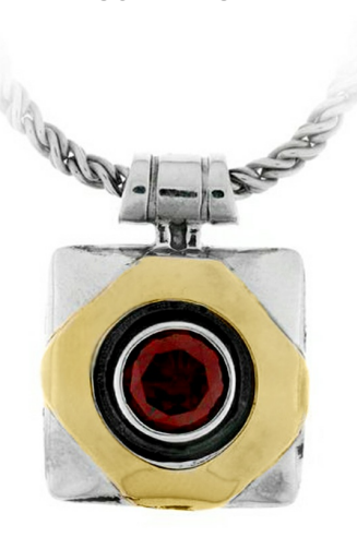
Silver and Gold Pendant $ 33.91