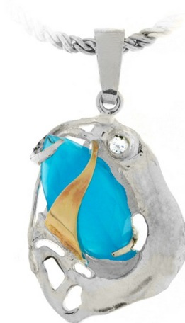
Silver and Gold Pendant $ 26.96