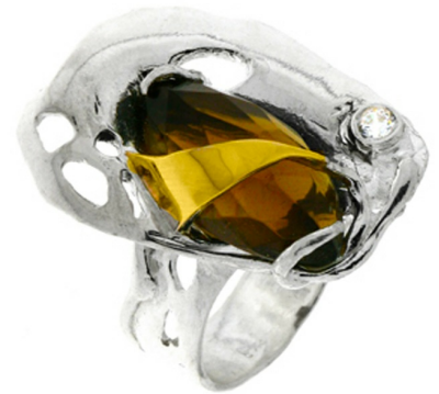
Silver and Gold Ring $ 33.91