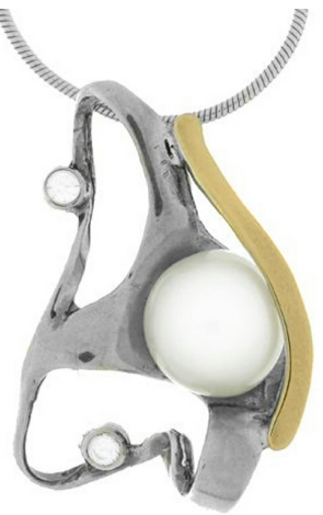
Silver and Gold Pendant $ 20.87