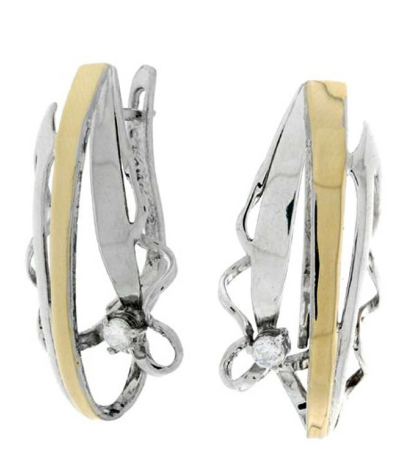
Silver and Gold Earrings $ 32.17

If the gemstone you require isn't in the gemstone selection charts please contact us and we will check if we can do the following ring with the gemstone of your choosing.