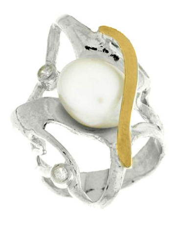
Silver and Gold Ring $ 43.04