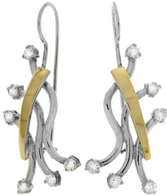
Silver and Gold Earrings $ 36.09