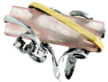
Silver and Gold Ring $ 26.09