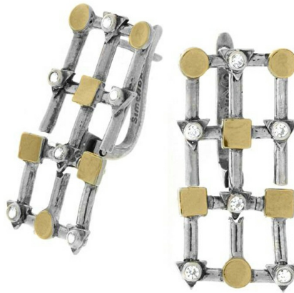
Silver and Gold Earrings $ 44.78