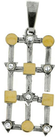
Silver and Gold Pendant 22.17 $