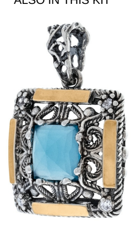
Silver and Gold Pendant $ 25.00