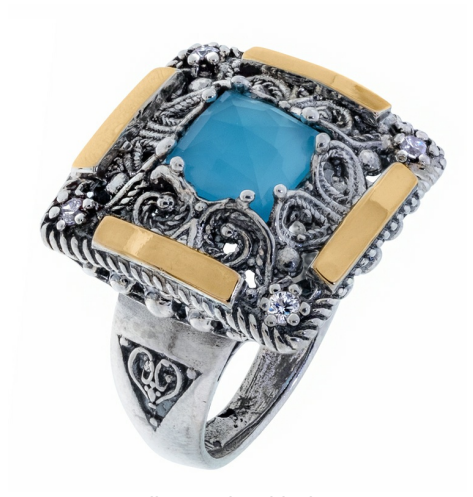
Silver and Gold Ring $ 32.00